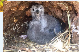
A wedge-tailed shearwater ('Ua'u kani) chick found in a burrow on MCBH.

Natural resources staff at MCBH also conduct long-term monitoring, which includes biannual waterbird surveys, annual breeding surveys of burrowing seabirds including the 'Ua'u kani, or wedge-tailed shearwaters, monitoring of the facility's MBTA-protected red-footed booby colony, and annual Audubon Christmas Bird Counts. These efforts help MCBH natural resources managers better understand the birds' biology and ecology, which in turn promotes more informed management decisions that increase MCBH's ability to protect these species while allowing the base to carry out its primary training missions.