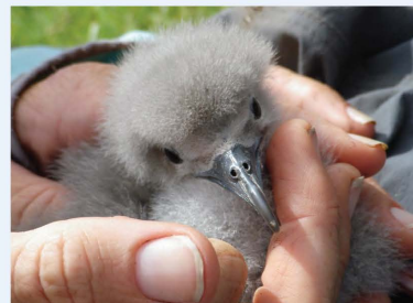
A wedge-tailed shearwater ('Ua'u kani) on MCBH.

Natural resources staff at MCBH also conduct long-term monitoring, which includes biannual waterbird surveys, annual breeding surveys of burrowing seabirds including the 'Ua'u kani, or wedge-tailed shearwaters, monitoring of the facility's MBTA-protected red-footed booby colony, and annual Audubon Christmas Bird Counts. These efforts help MCBH natural resources managers better understand the birds' biology and ecology, which in turn promotes more informed management decisions that increase MCBH's ability to protect these species while allowing the base to carry out its primary training missions.