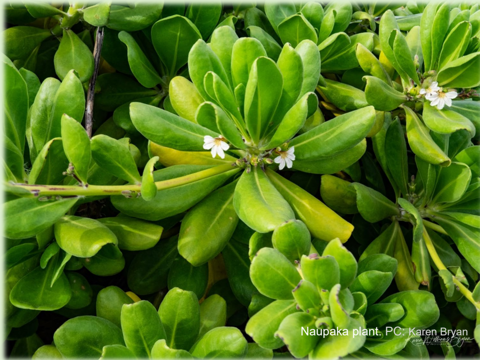
Naupaka plant.