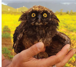
A juvenile pueo at Nuupia Pond Wildlife Management Area.