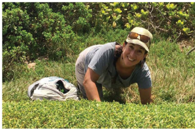
A staff biologist reaching into a wedge-tailed shearwater burrow on MCBH.

land. These efforts include studying the nesting and reproductive success of the federally endangered Ae'ō (Hawaiian stilt), the federally endangered 'Alae 'ula (Hawaiian gallinule), and the federally endangered 'Alae ke'oke'ō