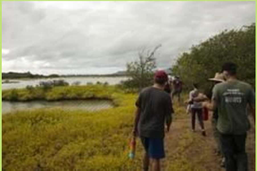
Weed Warrior Restoration work on Base 25Jul2020.

Happy National Public Lands Day, September 26, 2020! Not many of us may have heard of this national celebration. It is organized annually by the National Environmental Education Foundation. According to the National Park Service “It’s one of our nation’s largest single-day volunteer effort. It celebrates the connection between people and green space in their community.” At MCBH the Environmental Compliance and Protection Division is coordinating a volunteer vegetation project, starting on October 10 th , along Marine Corps Training Area Bellows shoreline in partnership with the local community. “Volunteers are welcomed as we help to restore native Hawaiian habitat working alongside our local community. Contact Environmental at 808-257-7129.