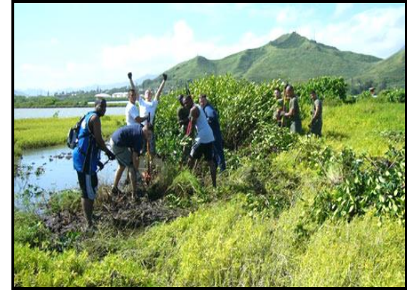
"Weed Warrior" volunteers, Kaneohe Nu'upia Ponds