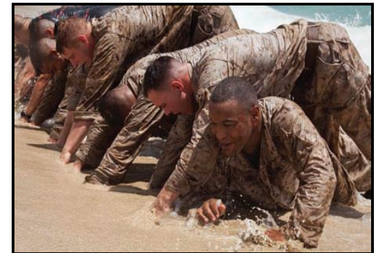
Hawaii Marine "Build the House" combat drill, Fort Hase Beach